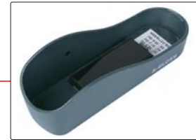
base with calibration block (included)