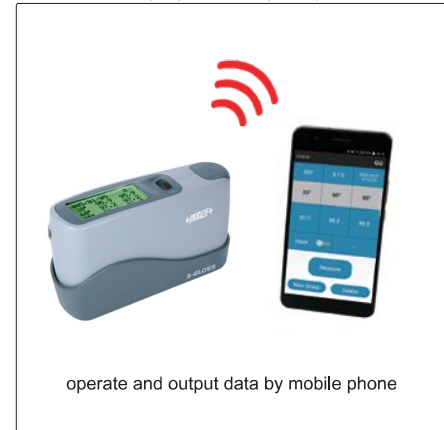
operate and output data by mobile phone

connect mobile phone via bluetooth (only Android system)