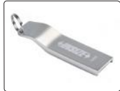
software flash disk (included)